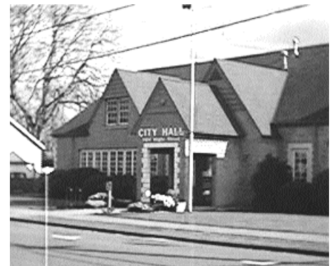
Sumner City Hall will be expanded to the east, left, into the employee parking lot.

The City Council is studying the fate of the older addition to the south. That building is in poor condition and is difficult and costly to re-use. Studies indicate that area will not be needed to meet City space needs in the future. If demolished, the area south of City