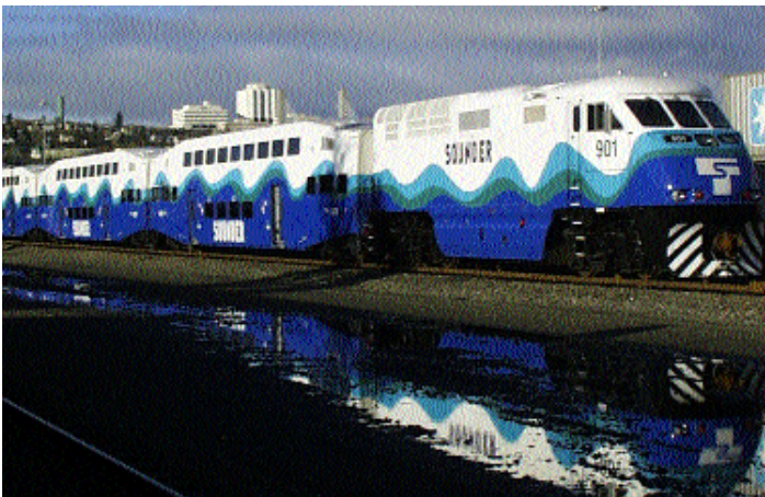
The Sounder train is seen on a recent demonstration run.

The voter approved Initiative-695 slashed the state's Motor Vehicle Excise Tax (MVET) which is a major source of revenue for many transit agencies. This initiative repealed the state's portion of the fee while other license renewal fees, such as Sound Transit's tax were unaffected. Although Sound Transit wasn't hit directly by the initiative, the loss of revenue is being felt with partner agencies unable to share costs for numerous transportation projects in the region. The state Department of Transportation's lack of funding significantly impacted the proposed track, signal, equipment and maintenance improvements to support both freight and commuter rail. Puget Sound Regional Council recently shifted $60 million of grant funds for capital improvements that will help fill the loss of state funds due to the passage of I-695.