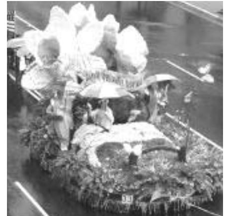
The Sumner float was awarded the Queen's Trophy at this year's Daffodil Parade.

All American Flag Day Celebration June 12 noon to 4 p.m. Sumner Athletic Complex Flag dedication • Music • Games • Contests Pack a picnic lunch and bring the family down for an afternoon full of community pride. ▶ Watch for the "Summer Fun" edition of Community Connections coming in June.