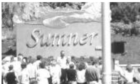
New Entryway Sign Unveiled