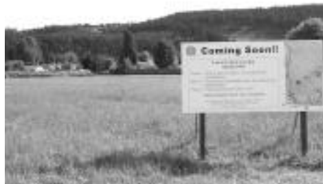
A sign announces the coming development of a new park on the corner of Meade McCumber Road and Parker Road.

Those who do not want to sponsor a specific item can donate to sponsor a "patch of the park" for a $50. Everyone who donates will have their name listed on a plaque which will be located in the park